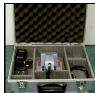
Aluminium carry case also available